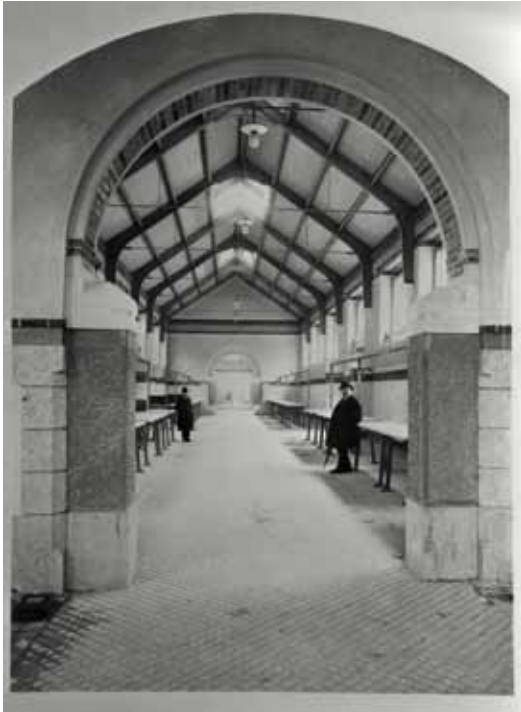
Vue intérieure des Halles centrales, Rennes, années 1920; Le Couturier (photographie); Guy Artur (reproduction); Norbert Lambart (reproduction) © Région Bretagne, 1999

Merci de respecter et de mentionner les légendes et les crédits photos lors des reproductions.