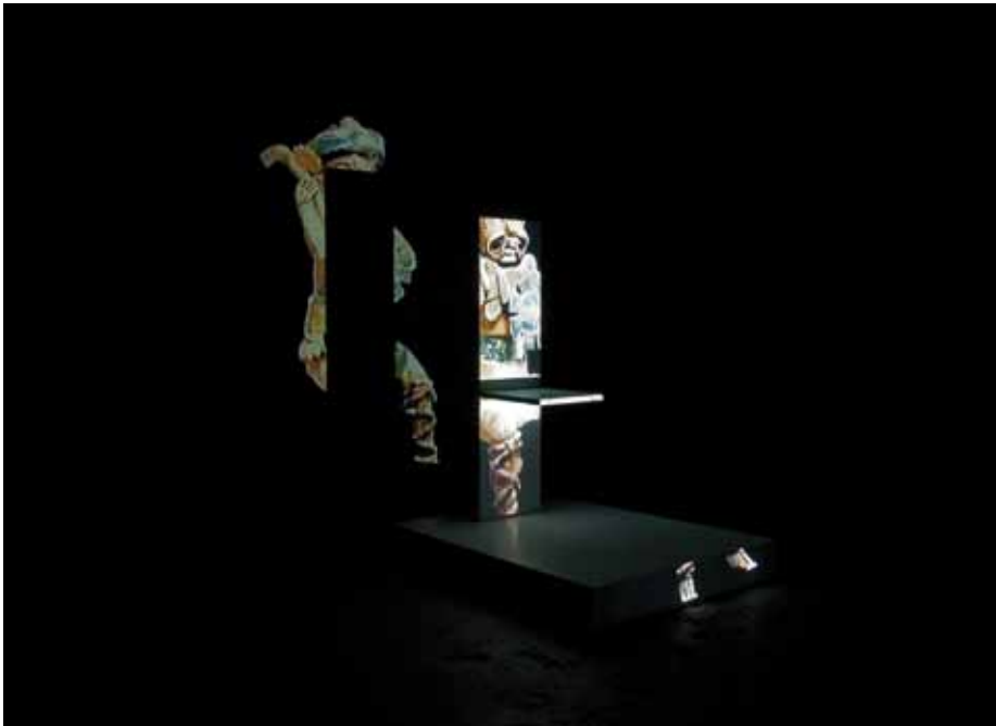
Gumpaste Incident, 2011 Bois, carton peint en blanc, vidéoprojection sonore