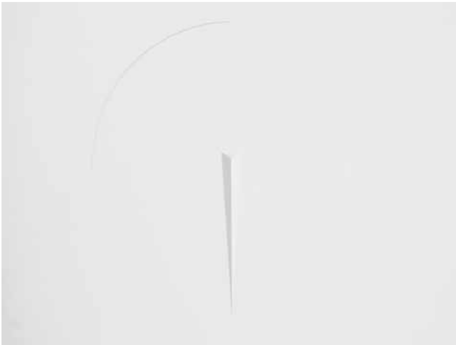
Untitled, 2013 Métal, vernis blanc